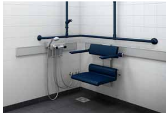
R7566: Shower chair 410. Height-adjustable 330 mm. It is possible to adjust the height of the seat and back rest independently of each other. Shown here with handrail/shower head with shower mixer bracket RT756.