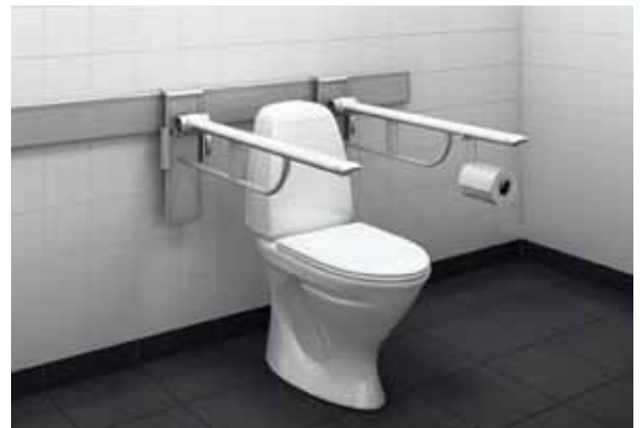
R3548: Toilet support arm with horizontal wall track, height-adjustable 250 mm, length 850 mm.