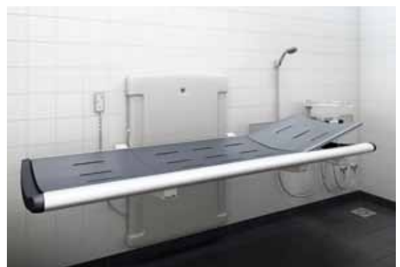
R8518: Nursing bench, height-adjustable with electric motor and remote control.