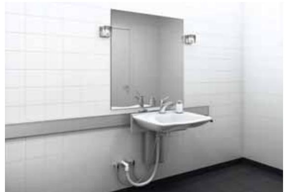
R4760: Washbasin bracket with gas cylinder, height-adjustable 300 mm. Pictured here with ergonomic washbasin R2050 and the RT622 tap.

” The key to a functional bathroom is a systematic assessment of the needs of the user and the carer as well as the room’s possibilities.